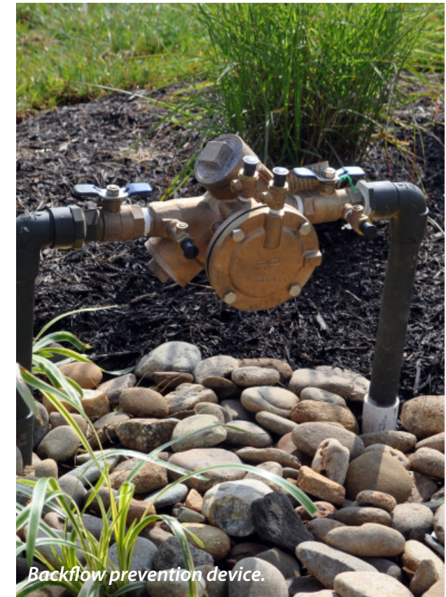
Backflow prevention device.

You can help protect the quality of our community's drinking water by using a backflow device to prevent cross-connection contamination.